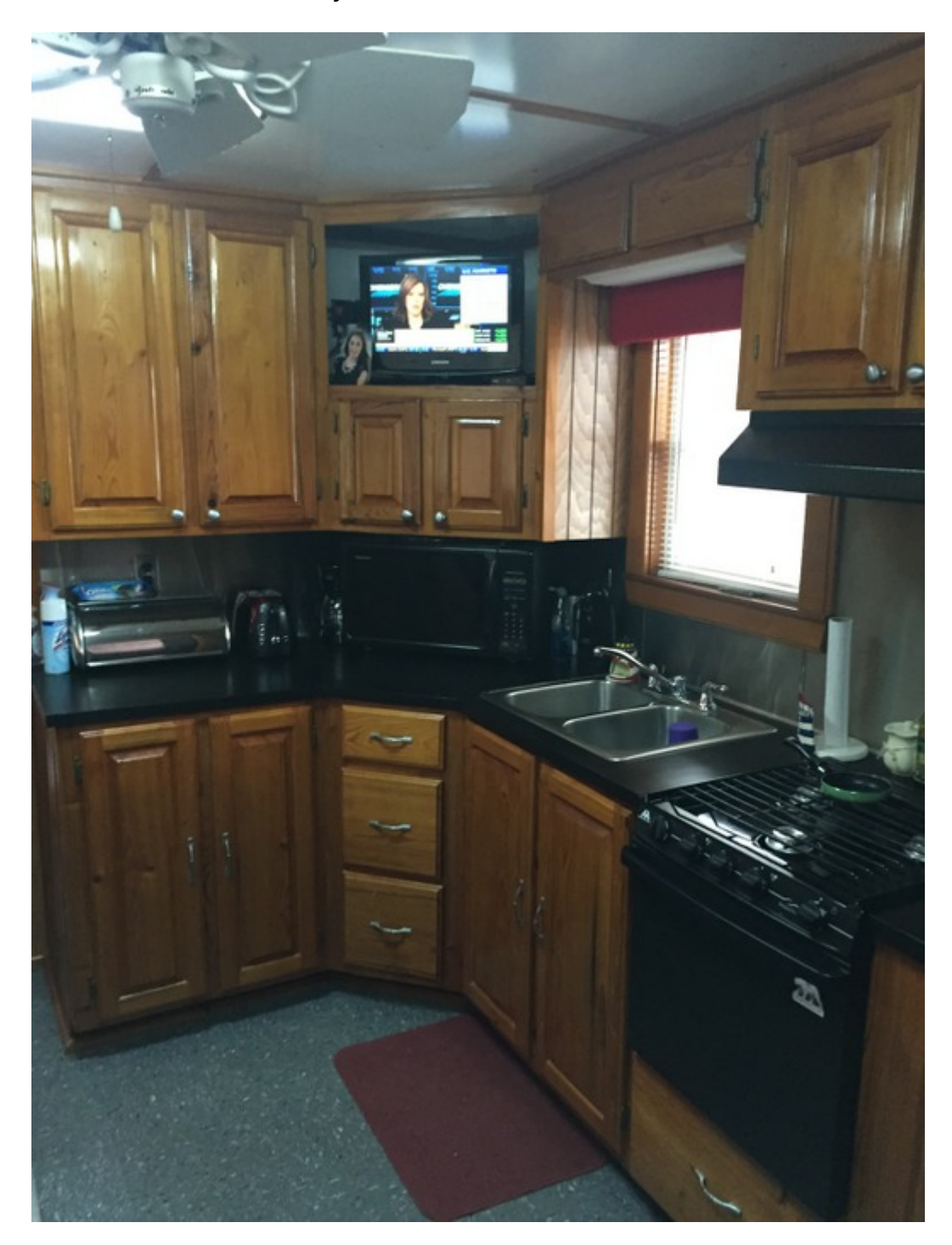
DISCLAIMER: Vessel description is believed to be correct, but not guaranteed. Price Subject to change without notice. Subject to prior sale or charter.

Comments: Immediately available! Great Condition!